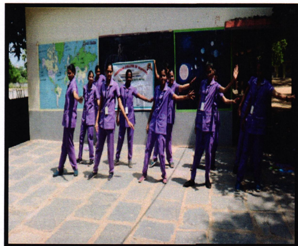
Flash mob by the students