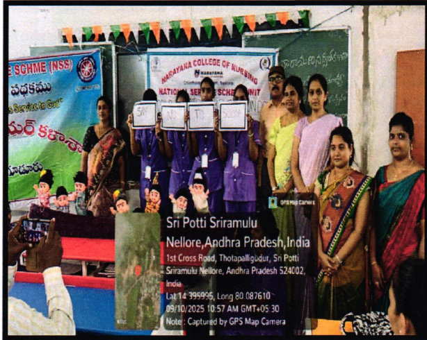
Group gathered at Govt. school