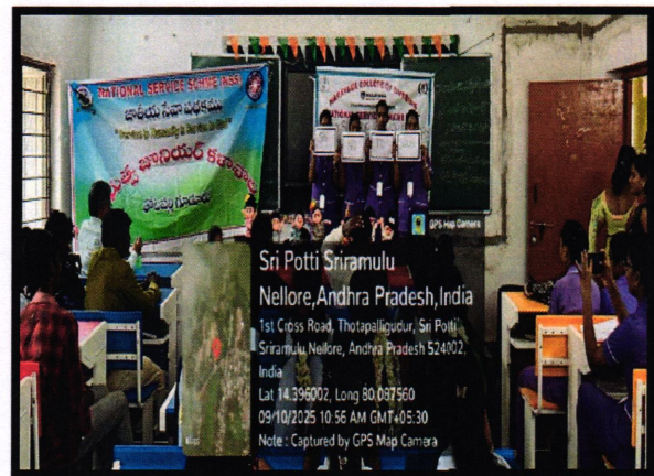
Puppet show performed by the students