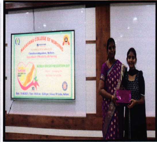
Prize distribution for winners